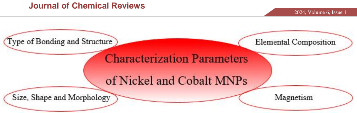
Figure 2. Different characterization parameters of Ni/Co MNPs

nickel carbides display subtle ferromagnetic attributes, suggesting that diverse synthetic pathways for their creation might yield various types. This is particularly evident when halide ions are introduced, as they may influence the absorption of carbon content through selective means.