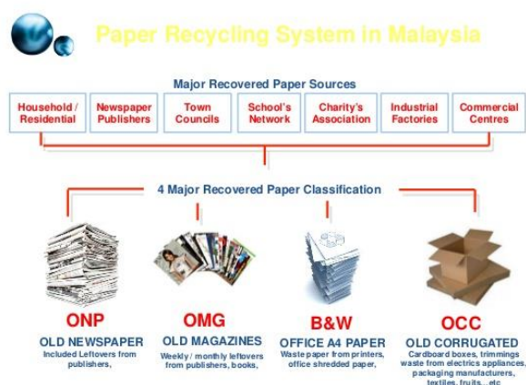
Figure 1. Malaysia Paper Industry 2012

of cardboard paper processing industries and the rest from department stores, voluntary institutions and other was obtained. Thus, more than half of the collected paper has never reached the final consumer. Regardless of the type of waste paper and who collects it, factories procure the waste paper they need from traders. Large recycling plants usually have a paper collection company that collects and supplies the factory raw materials. This method ensures the management of the factory. Figure 1 shows the Malaysia Paper Industry 2012.