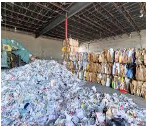
Figure 3: Global Waste Paper Recycling Market 2020 and estimated to grow in near Future

The most important step in achieving a coherent recycling program is separation at source. The country's waste management authorities should develop a comprehensive plan and instructions for collecting and recycling waste for homes and offices, etc. Given that investment in paper recycling is not due to the high cost of producing small industrial units. In fig.3 try to show that the global waste paper recycling market 2020 and estimated to grow in near future.