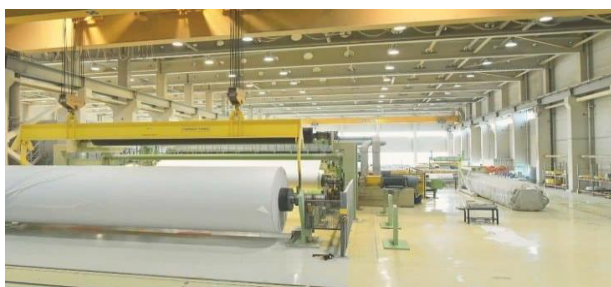
Figure 2: How Paper is Recycled: Step-by-Step Process (and Benefits Too)

they produce fuel for transportation. The industry tends to produce light products using minimal raw materials. In the paper industry, making lightweight paper from first-hand pulp is easier than recycled pulp.